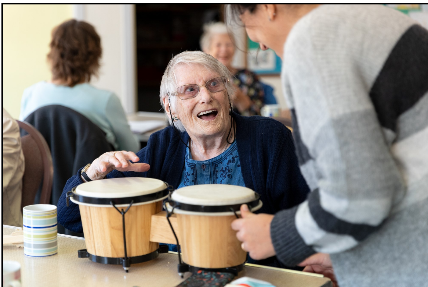
Photo shows SSR members enjoying an activity provided by North Yorkshire Music Therapy in October 2021

In this issue ,we are looking forward to Spring and returning to our usual services which are designed to offer practical support and advice together with social opportunities and friendship.